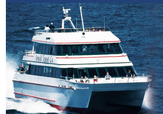
Mackinac Island Ferry