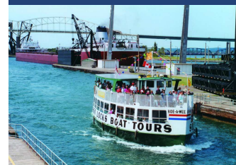
Soo Locks Cruise in Sault Sainte Marie