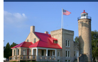
Mackinac Point Lighthouse