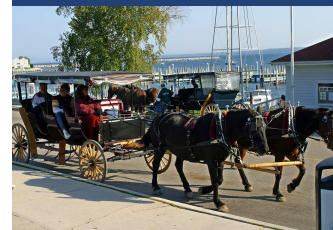
Tour Mackinac Island by Horse and Carriage