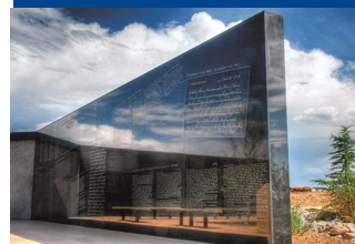
New Mexico Veterans' Memorial

Departing from: Stamart Travel Center 3936 E.Divide Ave Bismarck - Bus arrives @7:30AM CT departs at 8AM CT , bus arrives 8:15AM MT at Genex of Richardton 3721 Route 8 and depart @8:30AM MT, bus arrives @ 9AM MT at Peace Lutheran Church, 1550 21st St W, Dickinson , and departs @ 9:15AM MT