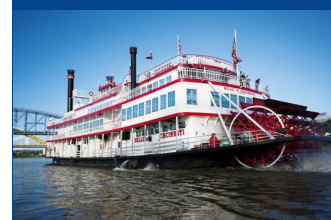
Enjoy a BB Riverboats Sightseeing Cruise