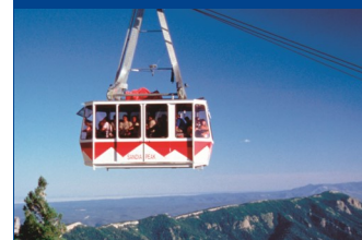
Breathtaking Views of the Sandia Mountains