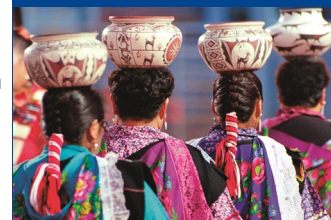
Native Southwestern Culture and Crafts