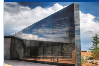
New Mexico Veterans Memorial